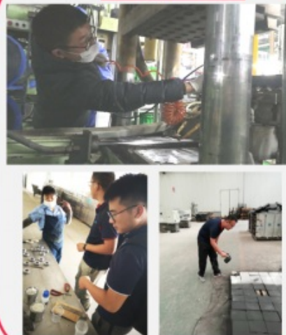
Testing in the field

Shanghai LoreChem Co., Ltd. was established in 2008. It is a high-tech enterprise which is dedicated to serve releasing products which involve semi-permanent release agent, anti-sticking, surface lubrication and thermal reactive adhesive. Shanghai LoreChem has been improving product quality for 15 years. The releasing products are mainly applied in rubber, polyurethane and composite industry. The brand of Lubekote for release agent and Thinkbond for adhesive have been registered in China. Both of them are well known in the industry.