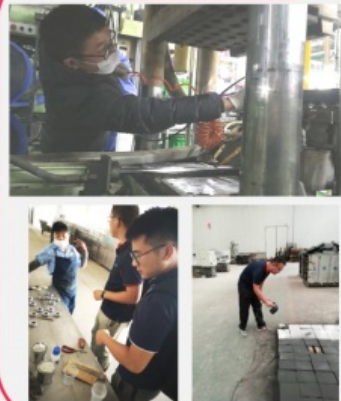
Testing in the field

Shanghai LoreChem Co., Ltd. was established in 2008. It is a high-tech enterprise which is dedicated to serve releasing products which involve semi-permanent release agent, anti-sticking, surface lubrication and thermal reactive adhesive. Shanghai LoreChem has been improving product quality for 15 years. The releasing products are mainly applied in rubber, polyurethane and composite industry. The brand of Lubekote for release agent and Thinkbond for adhesive have been registered in China. Both of them are well known in the industry.