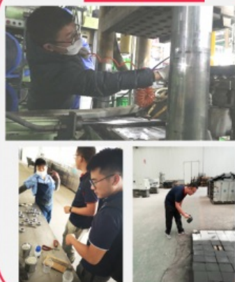
Testing in the field

Shanghai LoreChem Co., Ltd. was established in 2008. It is a high-tech enterprise which is dedicated to serve releasing products which involve semi-permanent release agent, anti-sticking, surface lubrication and thermal reactive adhesive. Shanghai LoreChem has been improving product quality for 15 years. The releasing products are mainly applied in rubber, polyurethane and composite industry. The brand of Lubekote for release agent and Thinkbond for adhesive have been registered in China. Both of them are well known in the industry. Shanghai LoreChem's business is all over the domestic and foreign high-end production enterprises by providing professional technical solutions and services. The company's long-term goal is to become one of the best suppliers of release agent in Asia.