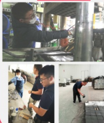
Testing in the field

Shanghai LoreChem Co., Ltd. was established in 2008. It is a high-tech enterprise which is dedicated to serve releasing products which involve semi-permanent release agent, anti-sticking, surface lubrication and thermal reactive adhesive. Shanghai LoreChem has been improving product quality for 15 years. The releasing products are mainly applied in rubber, polyurethane and composite industry. The brand of Lubekote for release agent and Thinkbond for adhesive have been registered in China. Both of them are well known in the industry. Shanghai LoreChem's business is all over the domestic and foreign high-end production enterprises by providing professional technical solutions and services. The company's long-term goal is to become one of the best suppliers of release agent in Asia.