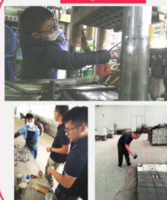
Testing in the field

Shanghai LoreChem Co., Ltd. was established in 2008. It is a high-tech enterprise which is dedicated to serve releasing products which involve semi-permanent release agent, anti-sticking, surface lubrication and thermal reactive adhesive. Shanghai LoreChem has been improving product quality for 15 years. The releasing products are mainly applied in rubber, polyurethane and composite industry. The brand of Lubekote for release agent and Thinkbond for adhesive have been registered in China. Both of them are well known in the industry.