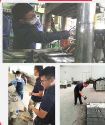
Testing in the field

Shanghai LoreChem Co., Ltd. was established in 2008. It is a high-tech enterprise which is dedicated to serve releasing products which involve semi-permanent release agent, anti-sticking, surface lubrication and thermal reactive adhesive. Shanghai LoreChem has been improving product quality for 15 years. The releasing products are mainly applied in rubber, polyurethane and composite industry. The brand of Lubekote for release agent and Thinkbond for adhesive have been registered in China. Both of them are well known in the industry. Shanghai LoreChem's business is all over the domestic and foreign high-end production enterprises by providing professional technical solutions and services. The company's long-term goal is to become one of the best suppliers of release agent in Asia.