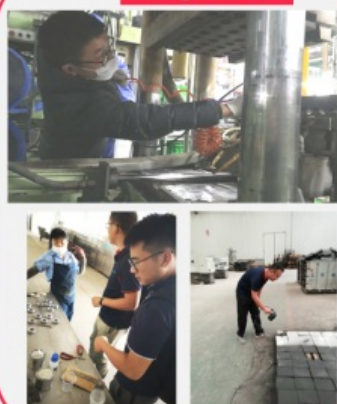
Testing in the field

Shanghai LoreChem Co., Ltd. was established in 2008. It is a high-tech enterprise which is dedicated to serve releasing products which involve semi-permanent release agent, anti-sticking, surface lubrication and thermal reactive adhesive. Shanghai LoreChem has been improving product quality for 15 years. The releasing products are mainly applied in rubber, polyurethane and composite industry. The brand of Lubekote for release agent and Thinkbond for adhesive have been registered in China. Both of them are well known in the industry.