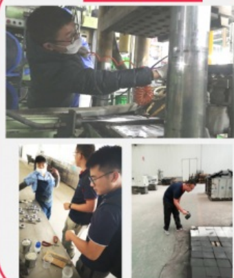
Testing in the field

Shanghai LoreChem Co., Ltd. was established in 2008. It is a high-tech enterprise which is dedicated to serve releasing products which involve semi-permanent release agent, anti-sticking, surface lubrication and thermal reactive adhesive. Shanghai LoreChem has been improving product quality for 15 years. The releasing products are mainly applied in rubber, polyurethane and composite industry. The brand of Lubekote for release agent and Thinkbond for adhesive have been registered in China. Both of them are well known in the industry.