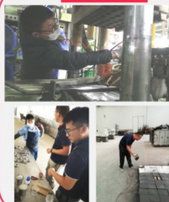
Testing in the field

Shanghai LoreChem Co., Ltd. was established in 2008. It is a high-tech enterprise which is dedicated to serve releasing products which involve semi-permanent release agent, anti-sticking, surface lubrication and thermal reactive adhesive. Shanghai LoreChem has been improving product quality for 15 years. The releasing products are mainly applied in rubber, polyurethane and composite industry. The brand of Lubekote for release agent and Thinkbond for adhesive have been registered in China. Both of them are well known in the industry.