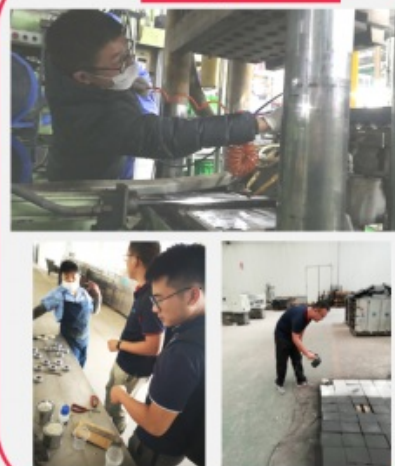
Testing in the field

Shanghai Lorechem has a professional technical service team, whose members are specialized in polymer materials engineering. They have a wealth of field testing.