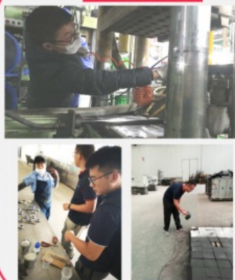
Testing in the field

Shanghai LoreChem Co., Ltd. was established in 2008. It is a high-tech enterprise which is dedicated to serve releasing products which involve semi-permanent release agent, anti-sticking, surface lubrication and thermal reactive adhesive. Shanghai LoreChem has been improving product quality for 15 years. The releasing products are mainly applied in rubber, polyurethane and composite industry. The brand of Lubekote for release agent and Thinkbond for adhesive have been registered in China. Both of them are well known in the industry. Shanghai LoreChem 's business is all over the domestic and foreign high-end production enterprises by providing professional technical solutions and services. The company's long-term goal is to become one of the best suppliers of release agent in Asia.