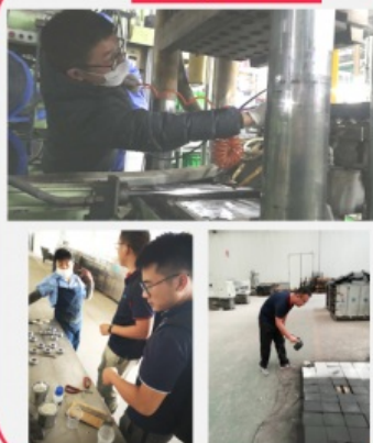
Testing in the field

Shanghai LoreChem Co., Ltd. was established in 2008. It is a high-tech enterprise which is dedicated to serve releasing products which involve semi-permanent release agent, anti-sticking, surface lubrication and thermal reactive adhesive. Shanghai LoreChem has been improving product quality for 15 years. The releasing products are mainly applied in rubber, polyurethane and composite industry. The brand of Lubekote for release agent and Thinkbond for adhesive have been registered in China. Both of them are well known in the industry. Shanghai LoreChem 's business is all over the domestic and foreign high-end production enterprises by providing professional