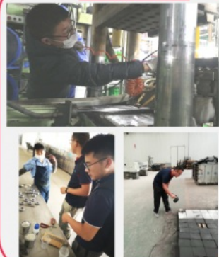
Testing in the field

Shanghai LoreChem Co., Ltd. was established in 2008. It is a high-tech enterprise which is dedicated to serve releasing products which involve semi-permanent release agent, anti-sticking, surface lubrication and thermal reactive adhesive. Shanghai LoreChem has been improving product quality for 15 years. The releasing products are mainly applied in rubber, polyurethane and composite industry. The brand of Lubekote for release agent and Thinkbond for adhesive have been registered in China. Both of them are well known in the industry.