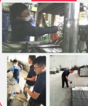
Testing in the field

Shanghai LoreChem Co., Ltd. was established in 2008. It is a high-tech enterprise which is dedicated to serve releasing products which involve semi-permanent release agent, anti-sticking, surface lubrication and thermal reactive adhesive. Shanghai LoreChem has been improving product quality for 15 years. The releasing products are mainly applied in rubber, polyurethane and composite industry. The brand of Lubekote for release agent and Thinkbond for adhesive have been registered in China. Both of them are well known in the industry.