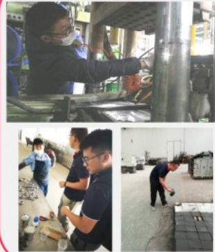
Testing in the field

Shanghai LoreChem Co., Ltd. was established in 2008. It is a high-tech enterprise which is dedicated to serve releasing products which involve semi-permanent release agent, anti-sticking, surface lubrication and thermal reactive adhesive. Shanghai LoreChem has been improving product quality for 15 years. The releasing products are mainly applied in rubber, polyurethane and composite industry. The brand of Lubekote for release agent and Thinkbond for adhesive have been registered in China. Both of them are well known in the industry.