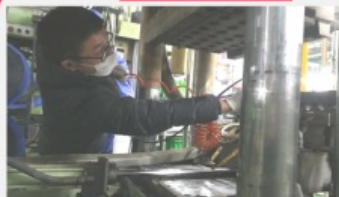
Testing in the field

Shanghai Lorechem has a professional technical service team, whose members are specialized in polymer materials engineering. They have a wealth of field testing.