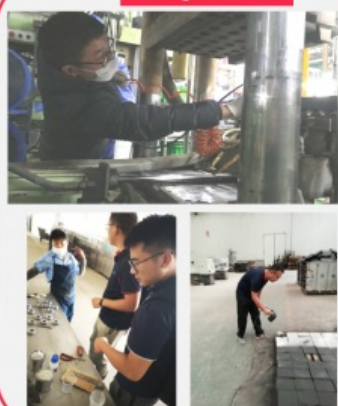
Testing in the field

Shanghai LoreChem Co., Ltd. was established in 2008. It is a high-tech enterprise which is dedicated to serve releasing products which involve semi-permanent release agent, anti-sticking, surface lubrication and thermal reactive adhesive. Shanghai LoreChem has been improving product quality for 15 years. The releasing products are mainly applied in rubber, polyurethane and composite industry. The brand of Lubekote for release agent and Thinkbond for adhesive have been registered in China. Both of them are well known in the industry. Shanghai LoreChem's business is all over the domestic and foreign high-end production enterprises by providing professional technical solutions and services. The company's long-term goal is to become one of the best suppliers of release agent in Asia.